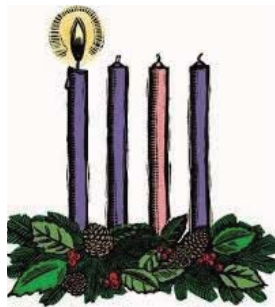
First Sunday in Advent